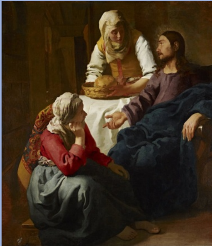
Christ in the House of Mary and Martha :: Proper 11, Year C (Johannes Vermeer, 1655)

www.standrewskentct.org * 860.927.3486 * st.andrew.kent@snet.net